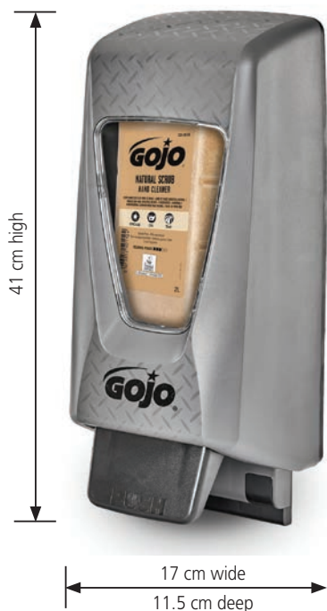
GOJO PRO TDX Dispenser • 2000mL Grey: 7200-01-EEC00DG