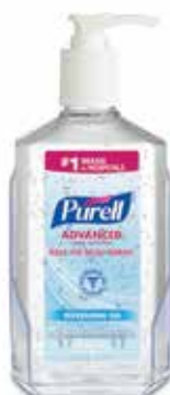
9008-12 Shown with 3659-12