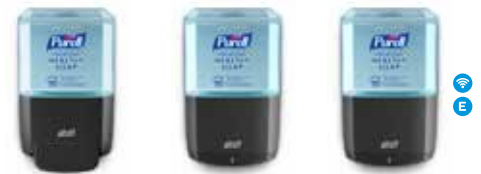
ES4 ES6 ES8

The latest breakthroughs in GOJO's dispensing innovation, combined with iconic PURELL design, have changed the face of wall-mount dispensers. Available for HEALTHY SOAP products and PURELL Hand Sanitizers, these dispensing systems are reliable and easy to maintain and complement any décor.