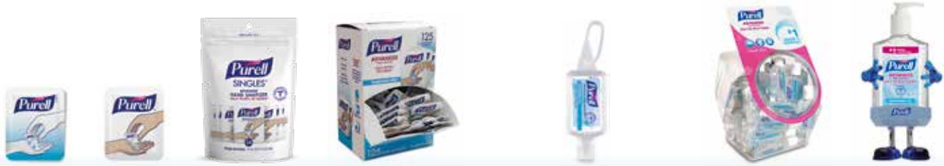
9620-2M 1.2 mL