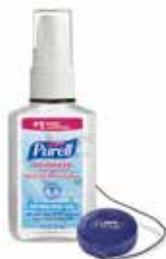
9608-24 Shown with 9606-24