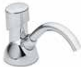
8500-01 PURELL CX™ PUSH-STYLE