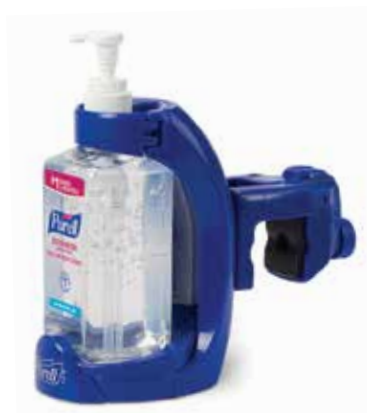
5704-06-BLU Shown with 3659-12