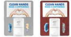
7399-HB-SLV Dispenser stand and refill sold separately

Convenient way to supply tissues, gloves, and masks and send a message about good hand hygiene.