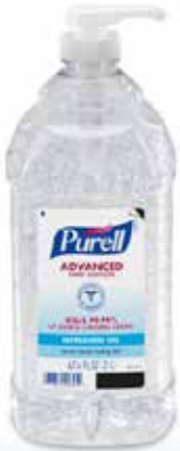
9625-04 2 liter