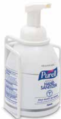
5700-06 Shown with 5792-04