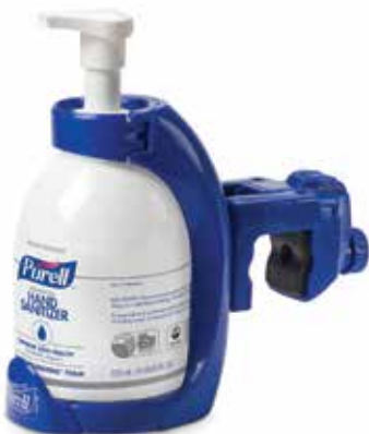
5704-06-BLU Shown with 5799-04

Allows you to place 535 mL sanitizer bottle where it's needed.