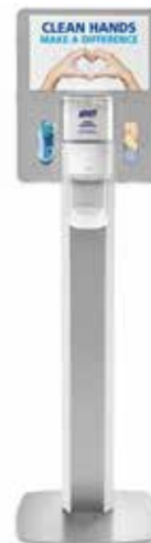
7308-DS-SLV with 7399-HB-SLV