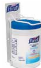
9001-01 Shown with 9113-06