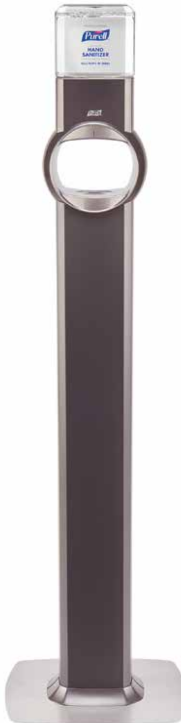
7724-DS PURELL FS™ Stand