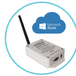
Network Gateway Receives captured events and opportunities and sends data through the Microsoft Azure Cloud

PURELL SMARTLINK Software Converts near real-time data into actionable reports and visual displays