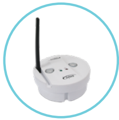
Activity Counter Tracks entries and exits in patient rooms and monitored areas

The PURELL SMARTLINK™ Activity Monitoring System uses proprietary technology to communicate with our smart, industry-leading dispensers and patient room activity counters. Battery-powered sensors featuring wireless technology reduce installation complexity.