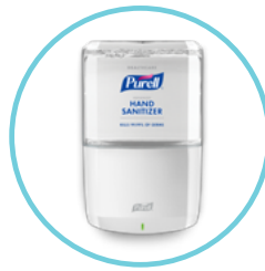
PURELL SMARTLINK Dispensers Capture soap and sanitizer dispenser activations